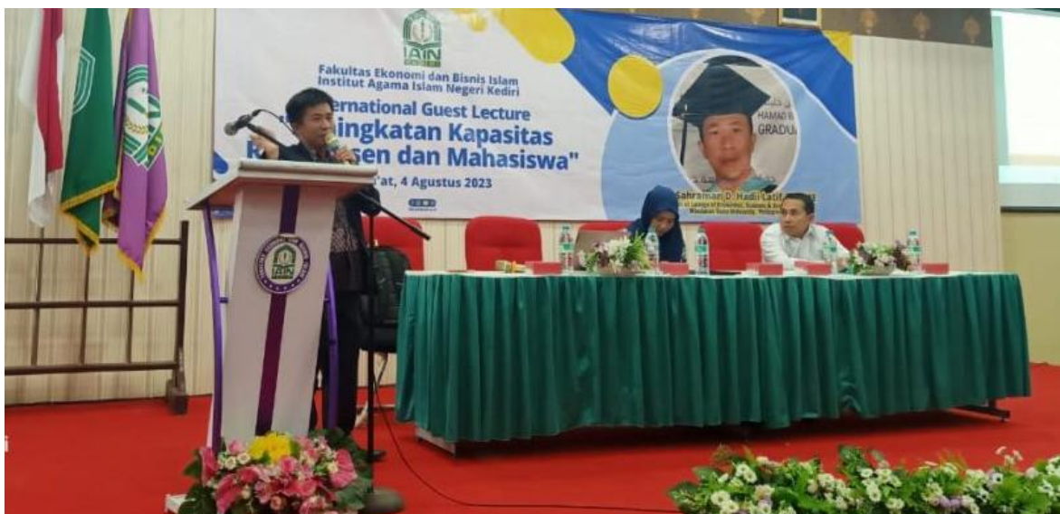
Figure 2. Presentating

The activity process ran smoothly with high enthusiasm from the participants. Lecturers and students are actively involved in discussions and individual consultation sessions regarding the scientific articles they write. Many questions were asked and a variety of topics were discussed, reflecting the participants' great interest in improving their writing skills and contributions to the academic world.