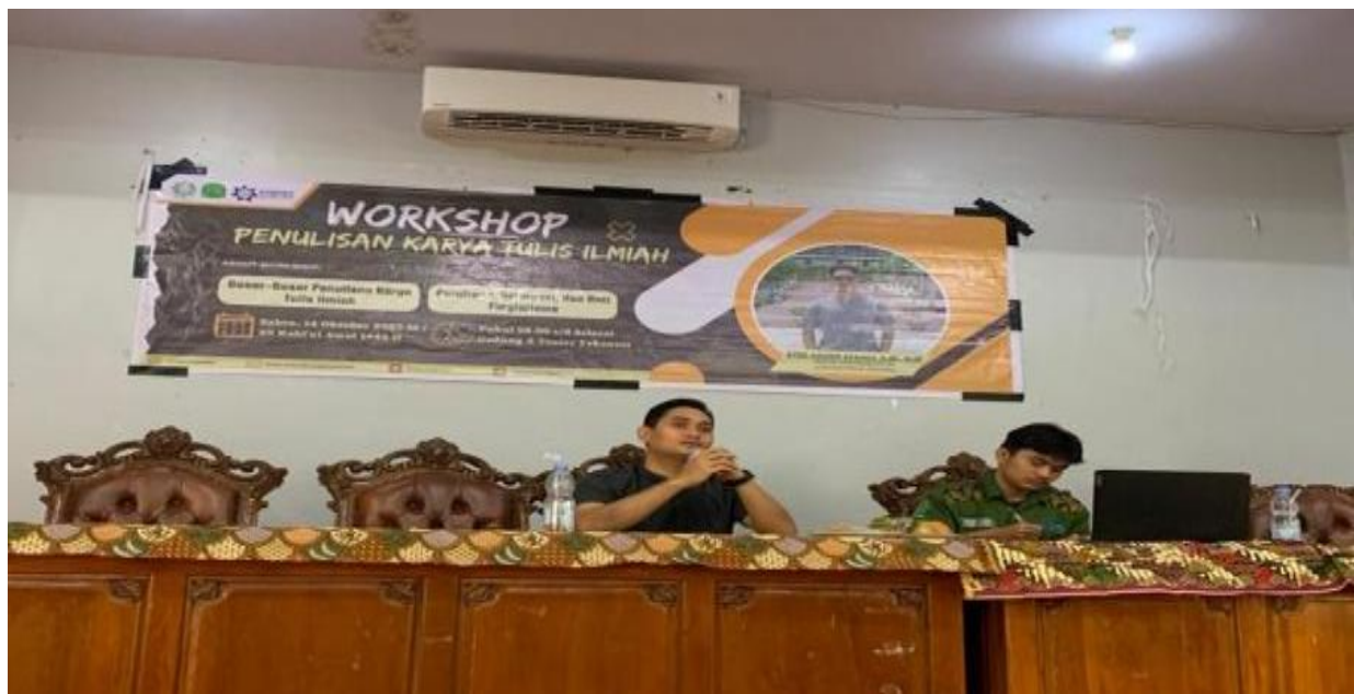
Figure 1. Activity Documentation

The initial condition was based on the pre-test results, namely that the participants did not fully understand the paraphrasing technique, and none of the participants knew how to use artificial intelligence to paraphrase. Participants also did not fully understand the techniques for citing a text. In general, participants still understand quoting as the act of copying a text from the original source and writing down the source of the quotation. Furthermore, participants also did not fully know the reference manager application. Generally, participants still manage references manually. The participants who already knew about the application did not fully use it because they did not understand how to use it.