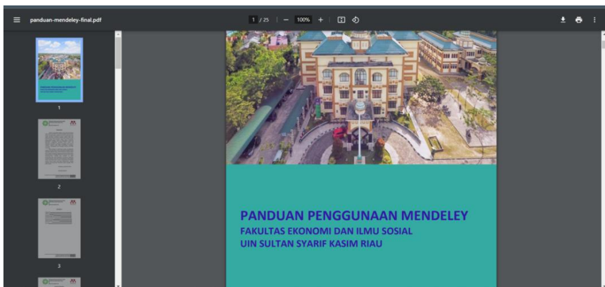
Figure 2. Mendeley Manual Book

Reference management helps maintain the academic integrity of a work, provides insight into the literature that supports arguments or findings, and facilitates the reproduction or verification of research by others. By using the right reference management tools (such as Mendeley), authors can more efficiently manage and reference information sources. After carrying out this service activity, based on the results of the post-test conducted, it was concluded that there was an increase in participants' skills in paraphrasing a sentence, an increase in skills in making quotations, and an increase in skills in reference management.